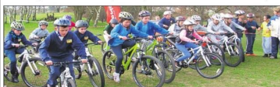
They're off: The youngsters get going in the race for the Sutton Primary Schools Cycling Championship

Primary school uses pedal power to become champs