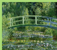
The Water Lily Pond