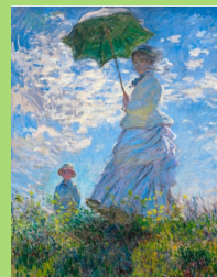
Woman with Parasol