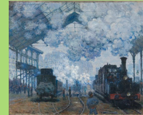
The Saint-Lazare Station