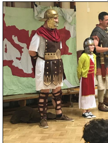
Y4 - 'I am Warrior' By Jessie Sole & Laavanya Kirushanthan (Maple Class)

Last week it was Year 4's Romans Day! We learnt lots about Roman numerals and came in dressed up as Romans ready to learn about lots of interesting